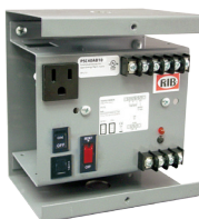
Shown Without Cover

Main Breaker ON/OFF: Switch / Breaker (10 Amp) (Kills power to entire unit: Outlets, Aux. Output, & Transformer)** Total Combined Output 9A Mounting: Mounting plate included (as shown) Approvals: Class 2 (UL Approved UL5085-3), UL916, UL508, C-UL, CE, RoHS Dimensions: 6.250" x 5.620" x 4.250" Weight: 4.40 lbs. (PSC40AB10) 5.80 lbs. (PSC100AB10)