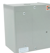
Shown With Cover